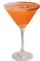
Spice, Spice Baby

Jim Beam, Cinzano Rosso, Lime Juice, Bitters