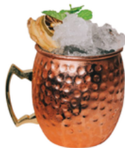
Mimpi Daddy Mule

Kaffir Lime Infused Gin, Fresh Lime, Spiced Syrup