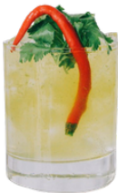
Green Refreshing Gin, Lime, Coriander, Chili