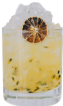
Passionfruit Caipiroska Vodka, Passionfruit, Lime Juice, Chile, Fresh Lime