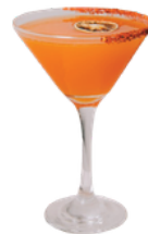
Spice, Spice Baby Tequila, Triple Sec, Lime, Curly Chilli, Salt

*Rates are all inclusive of tax & services. Transport included in Canggu, Legian, Seseh, Kuta, Seminyak areas - if outside of these areas travel fees apply. Dietary requirements may incur an extra fee.